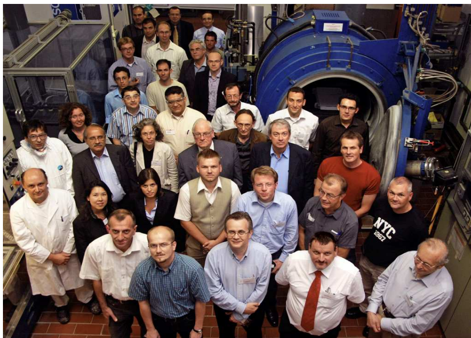
Delegates to the 2008 Aluminium Brazing Seminar in the Applications Laboratory of Solvay Fluor GmbH, Hannover.

This seminar was presented on 2 nd and 3 rd September at the Conference Centre located on the Solvay Fluor GmbH site in Hannover, Germany. Four of the 38 delegates that had booked a place informed us on 1 st September that they were unable to attend, and so 34 delegates attended. These were representing 17 companies drawn from the following 13 countries. (Germany, Sweden, Denmark, Poland, Romania, France, Luxembourg, Spain, Mexico, United Kingdom, Thailand, Italy and Brazil)